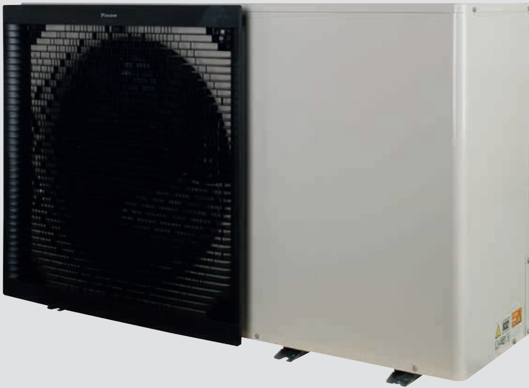
Air cooled mini inverter chiller and heat pump